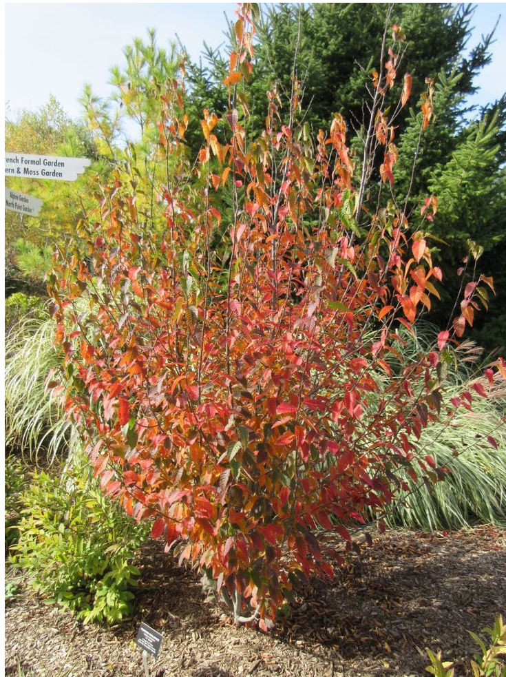
Firespire Ironwood fall color.