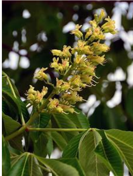
Blooms of the Early Glow Buckeye

This unique tree has a beautiful yellow bloom, unique leaf set, and excellent fall color. When planted in full sun, be sure to give this medium sized tree extra moisture. Again, Buckeyes preform well in lower areas that tend to hold moisture. Japanese Beetles may land on this tree. Buckeyes are fatal if horses or livestock ingest.