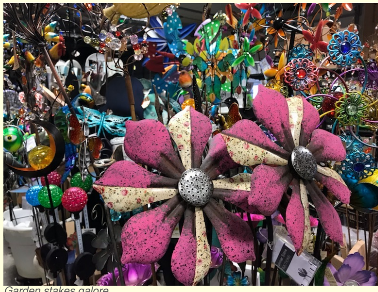
Garden stakes galore