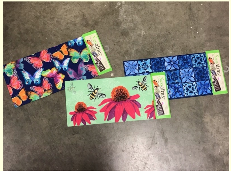
We are loving the fresh colors on the 2019 interchangeable Sassafras Mats.

I had to include these two guys because we all wish we were somewhere warm enough for shorts and a t-shirt.