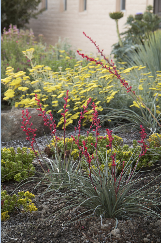
Brakelights Yucca - Monrovia.com