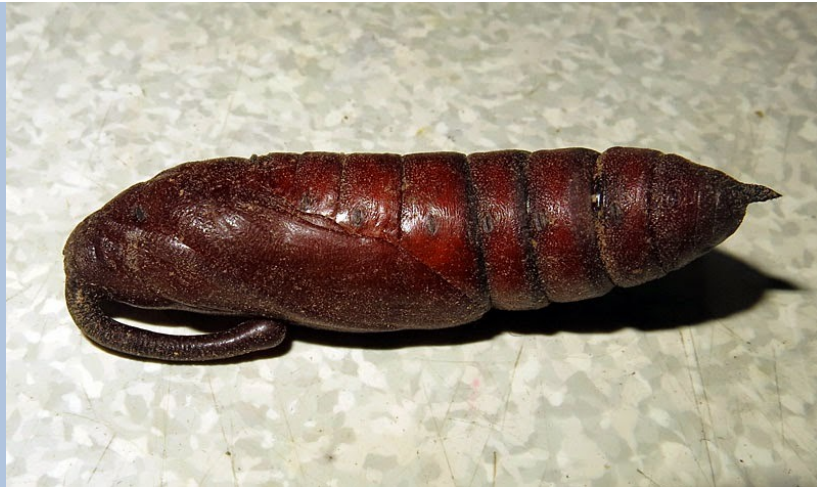
Pupal case of the Sphinx Moth commonly called a Hummingbird Moth.