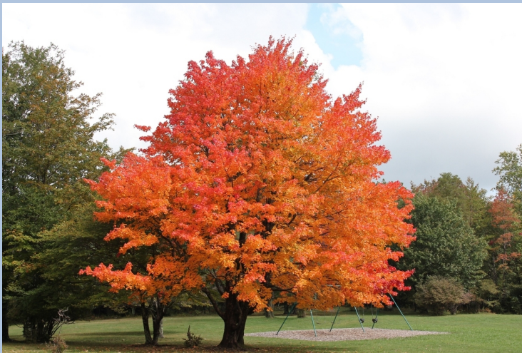
Exceptional fall color of the Sugar Maple Family