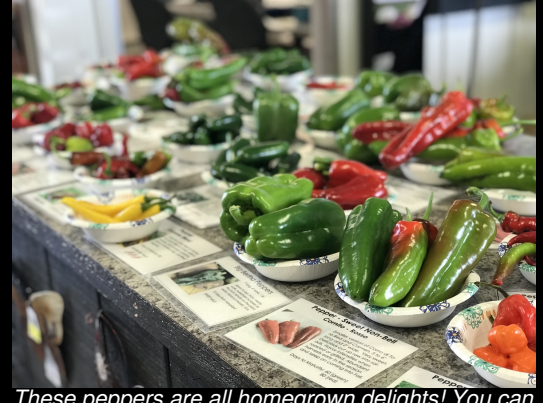
These peppers are all homegrown delights! You can

Its time for us to spoil you! We are excited to say our annual Customer Appreciation Day will be August 24th 11:00-2:00.