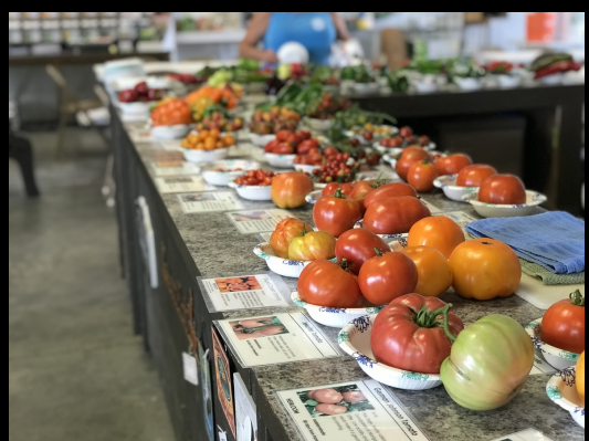
Time to step out of your comfort zone. Come try new varieties for next years garden.

Join us on August 24th to sample a wide variety of tomatoes and peppers.