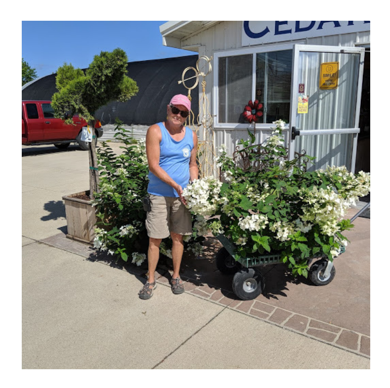
WOW!!!! Talk about size!