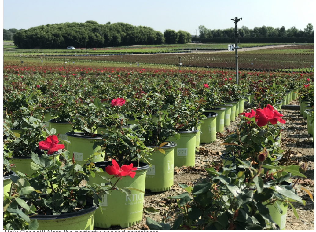
Holy Roses!!! Note the perfectly spaced containers