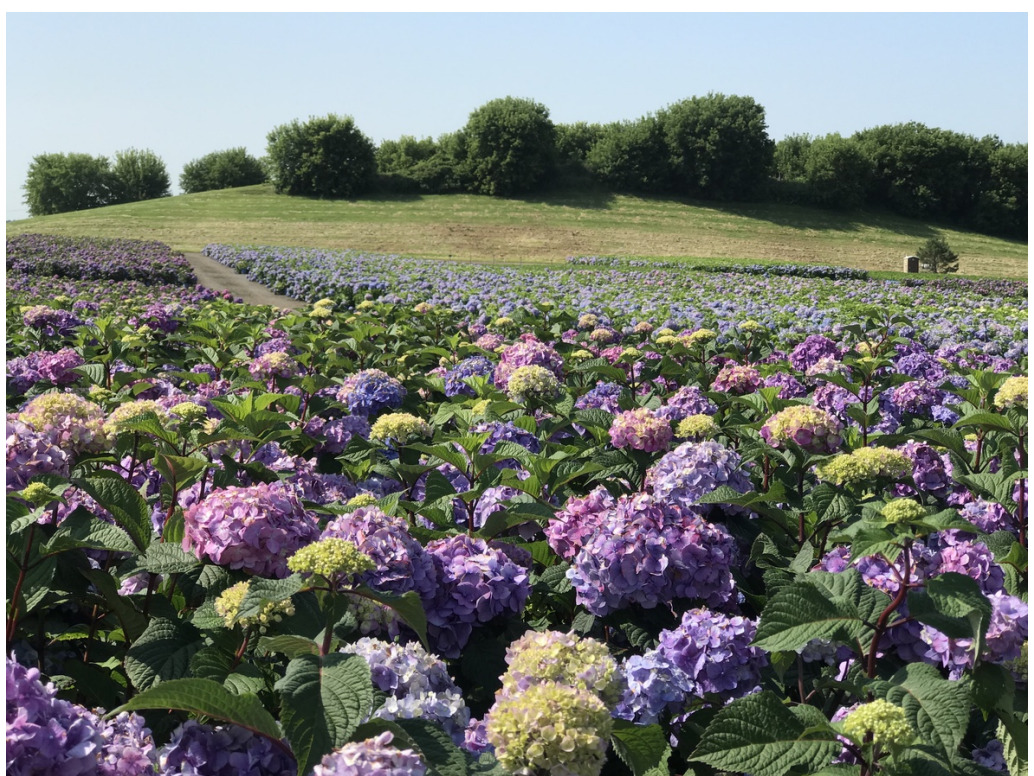
Bloomstruck Hydrangea enjoying the soft Minnesota sunlight.