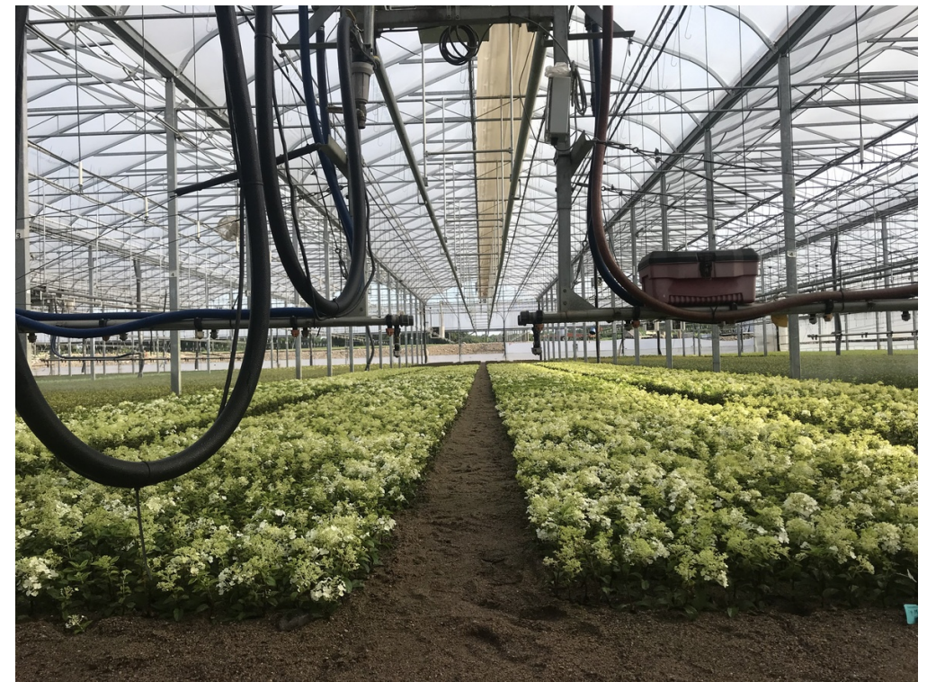
Thousands of cuttings of Hydrangea.