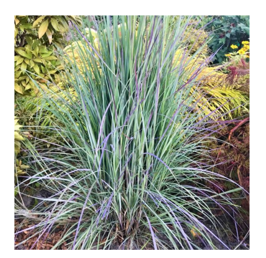
Nature Hills Nursery