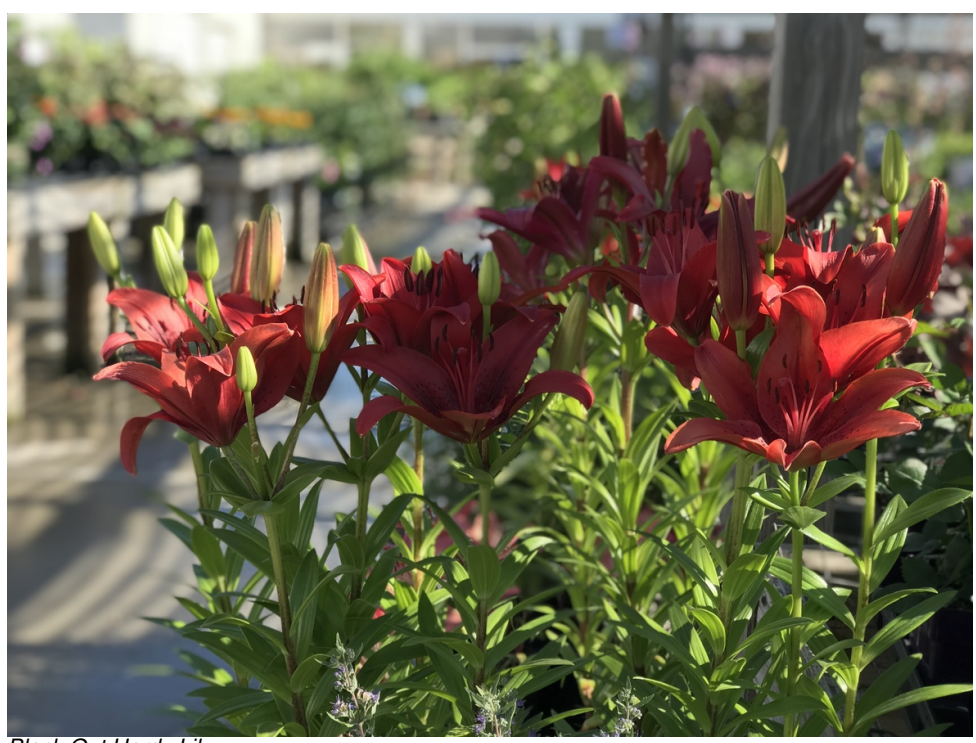
Black Out Hardy Lily