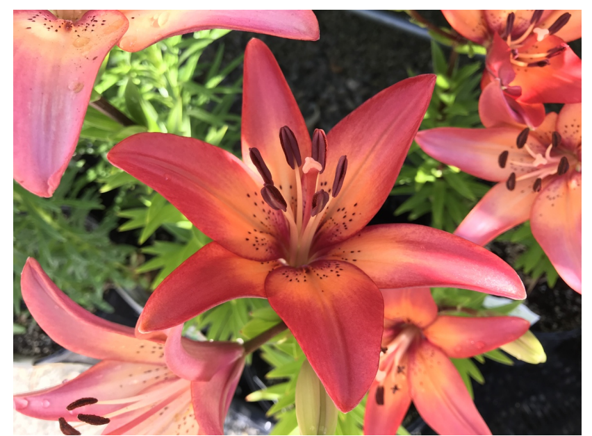
Royal Sunset Lily