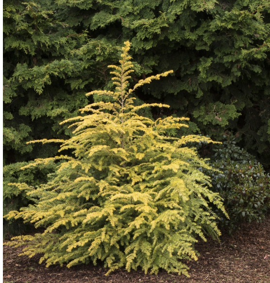
Golden Duke Hemlock - slow growing to 10' tall and 3' wide.