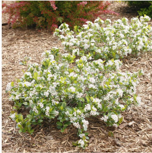
Low Scape Aronia