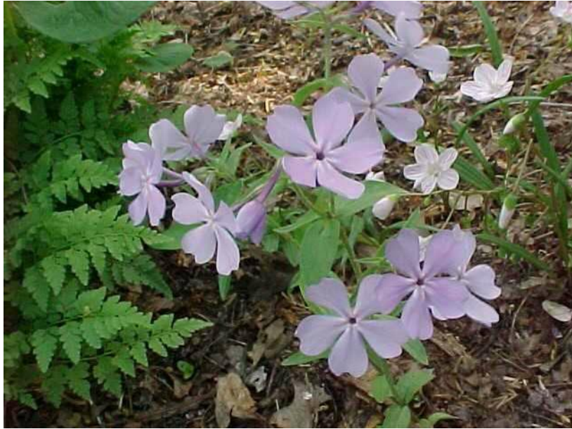
Phlox divaricata - Woodland Phlox