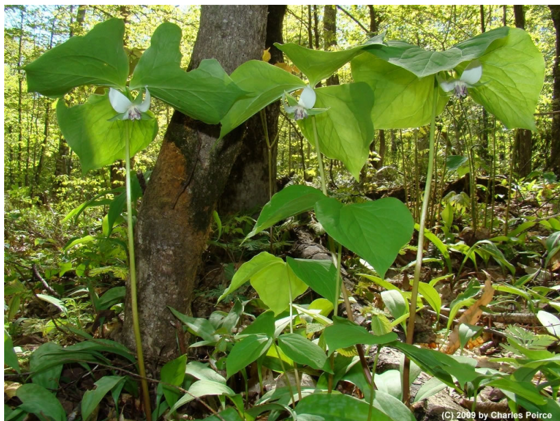
Trillium cernuum - Nodding Trillium