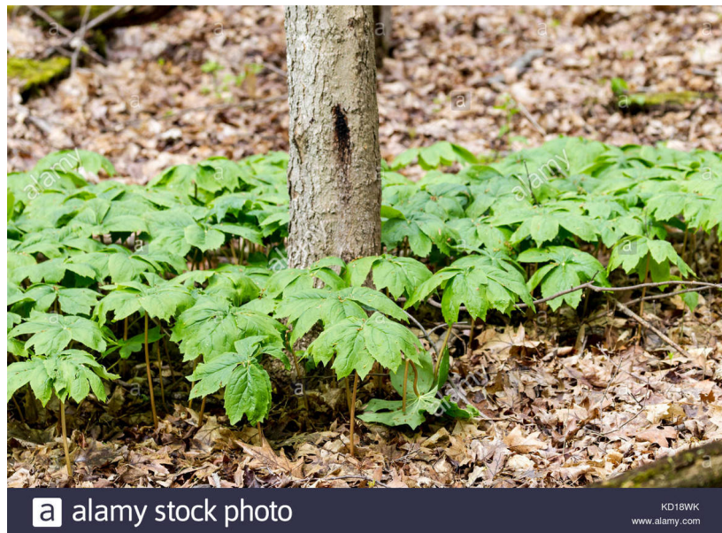
Podophyllum peltatum - Mayapple

If the rain ever does stop, head out to one of our beautiful local parks and see if you can spot these native plants.