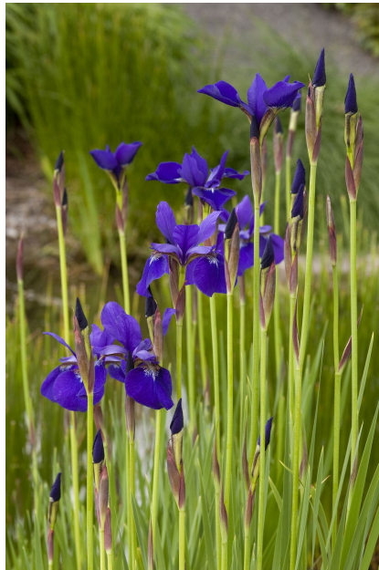
Siberian Iris