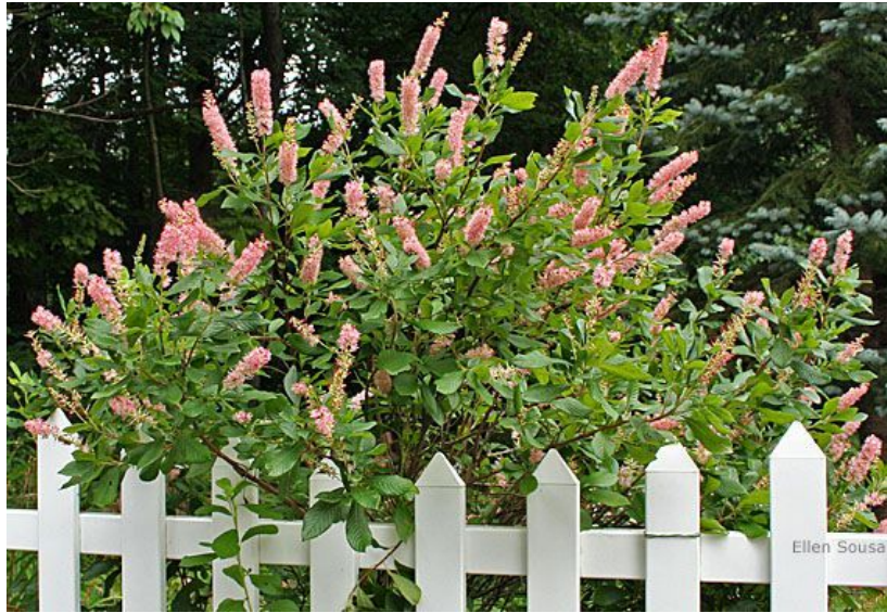
Ruby Spice Summersweet