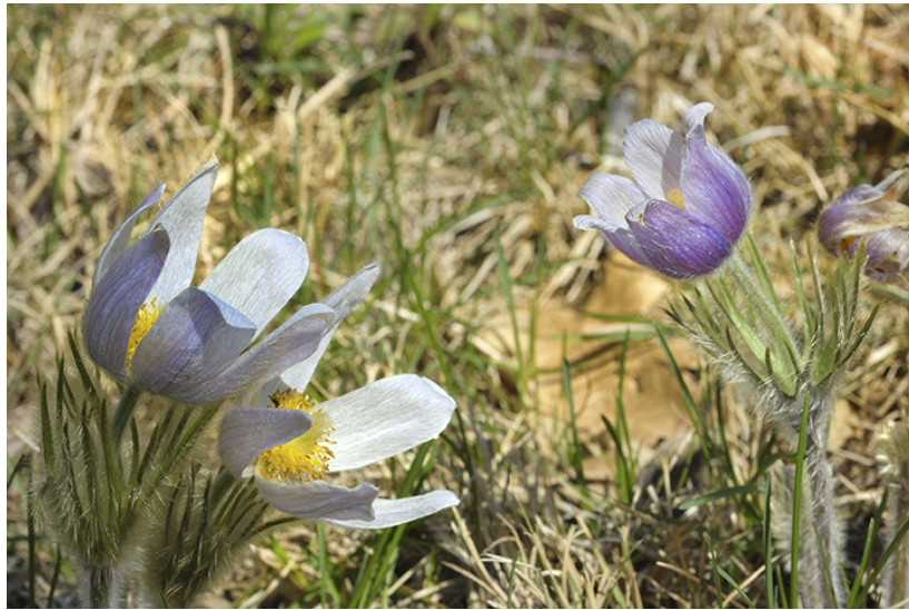
Pasque Flower