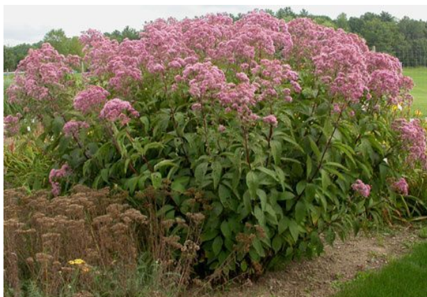
Joe Pye Weed

Why we love it: A few of the Switchgrass varieties such as 'Cheyenne Sky' and 'Shenandoah' turn a burgundy fall color. 'Northwind' is a vertical accent grass that tends to go yellow and then beige in the fall. Deer resistant. Zone: 4.