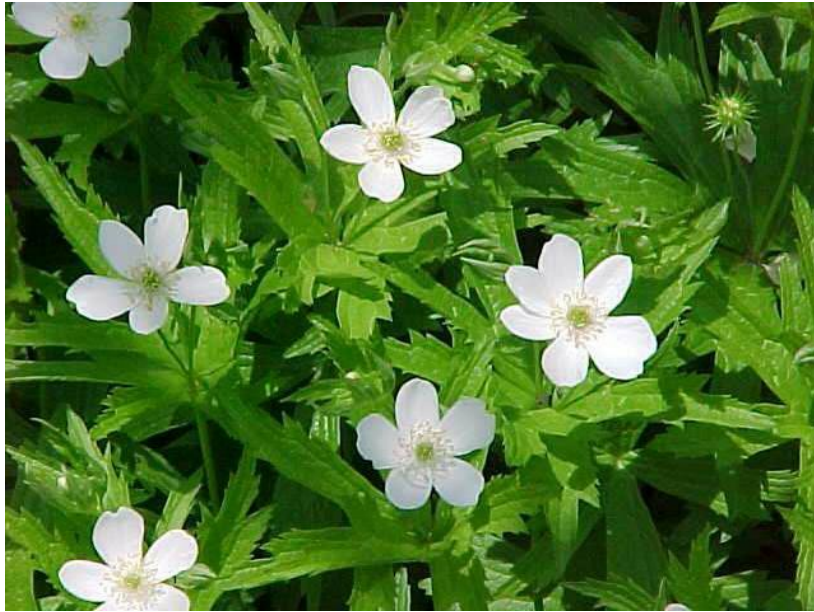
Anemone canadensis - Windflower