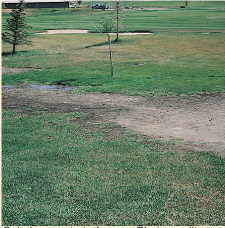
Salt damage to turf grass.