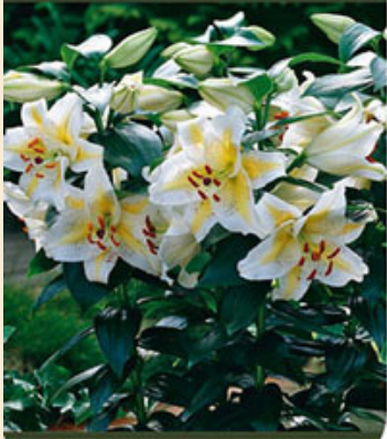
Fragrant Lily Oriental 'Little Rainbow'