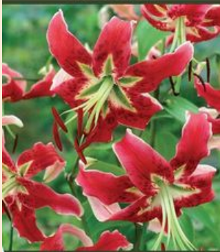
Tiger Lily Hardy Lily Black Beauty