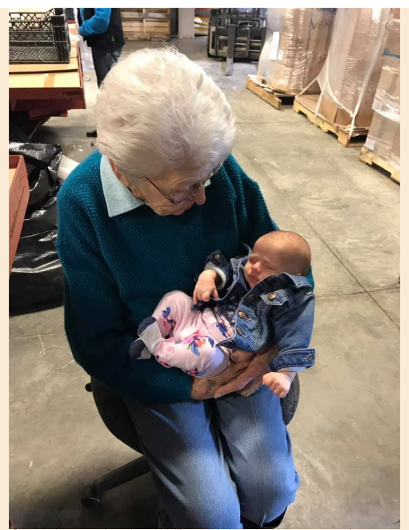
Our number one photo has 198 likes and shared a sweet moment between our oldest and youngest employees.